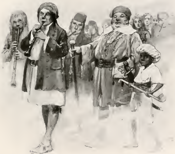
A negro boy walked beside him, carrying the long pipe. (P. 340.)

He looked exactly as he had done before, except